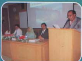
One Day Workshop of Bioinformatics