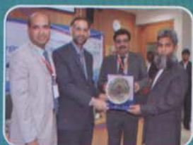
International Conference on Emerging Trends in Management