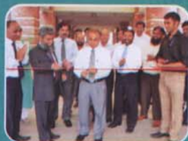
Industrial Open House, 2013